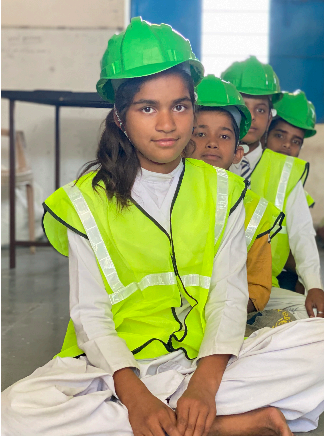
Children in Gogunda, India, learn how to keep themselves and others safe at school, should a disaster strike. In addition, community-based child protection services are equipped to become better prepared to identify and address issues arising from both slow- and rapid-onset climate-induced events.