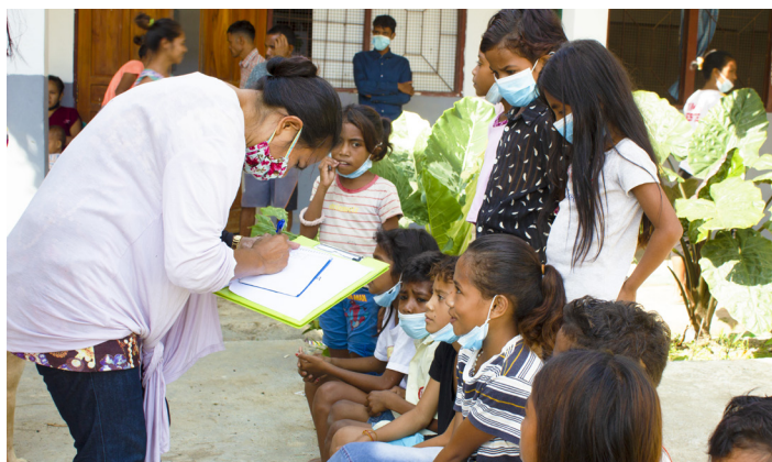
A group of children participate in emotional support activities in Timor-Leste

As the pandemic affected the daily lives of families and communities, children's exposure to violence increased. Economic uncertainty exacerbated the occurrence of family and gender-based violence; illness and death resulted in the loss of parental care for countless children; and the pandemic disrupted many prevention measures designed to protect children. 7