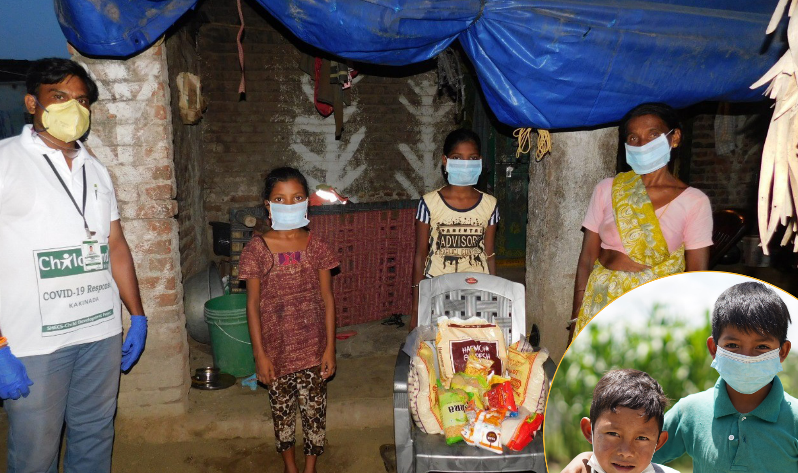
Above: A family in need receives food baskets and hygiene kits from ChildFund; Right: Two young boys in Guatemala receive livelihood assistance as part of ChildFund's livestock support for rural households