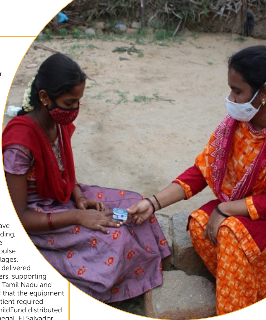
A nurse in India tests oxygen levels in a rural village

In Luangwa, Zambia, ChildFund provided two hospitals with four oxygen machines, a suction machine and tubes, two ICU beds, and hazmat suits. We also provided 26 schools with thermal scanners and better handwashing facilities. In Emali, Kenya, ChildFund provided more than 1,800 children with facemasks and set up 10 handwashing stations around the community.