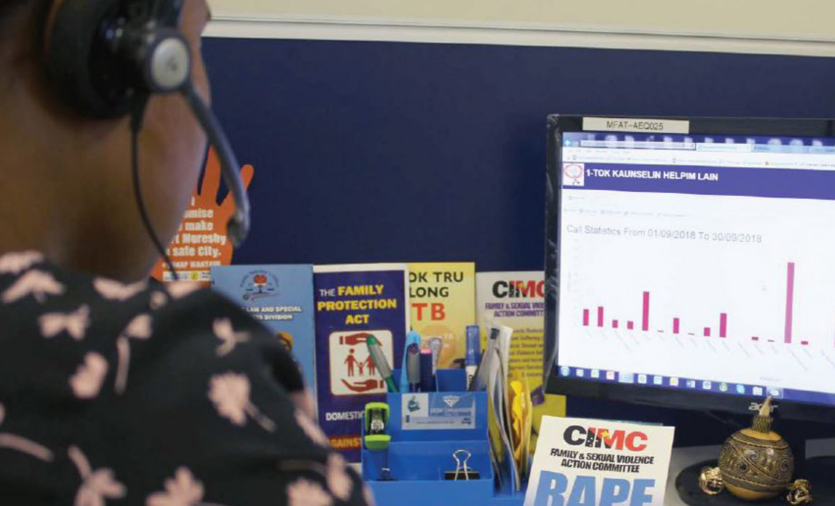
A crisis counselor in Papua New Guinea fields calls to the national crisis hotline

In Papua New Guinea, ChildFund expanded a national crisis hotline that was launched in 2015 in partnership with the Family and Sexual Violence Action Committee and FHI 360—an international non-governmental organization. The expanded service enabled more than 2,300 survivors and members of the public to access the Helpline, which connects them with professional counselors.