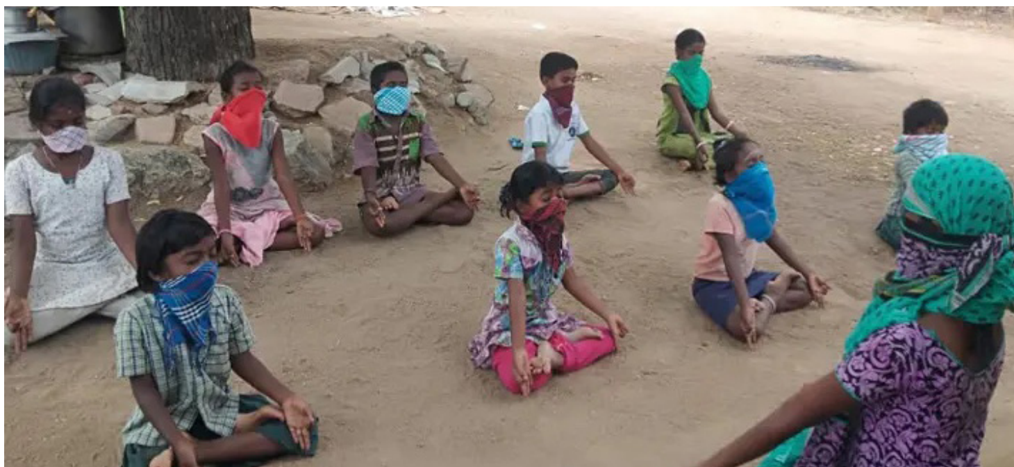
Children and youth take part in a psychosocial support session in India

ChildFund members reported receiving an increase in reports of violence against children, specifically in gender-based violence, child sexual abuse, child marriage, child labor, robberies and street harassment. Through our programs and collaboration with local providers, we were able to help more than 51,700 child participants in child protection and/or psychological or psychosocial support activities . In addition, ChildFund provided information on child protection and responsive parenting to nearly 400,000 caregivers .