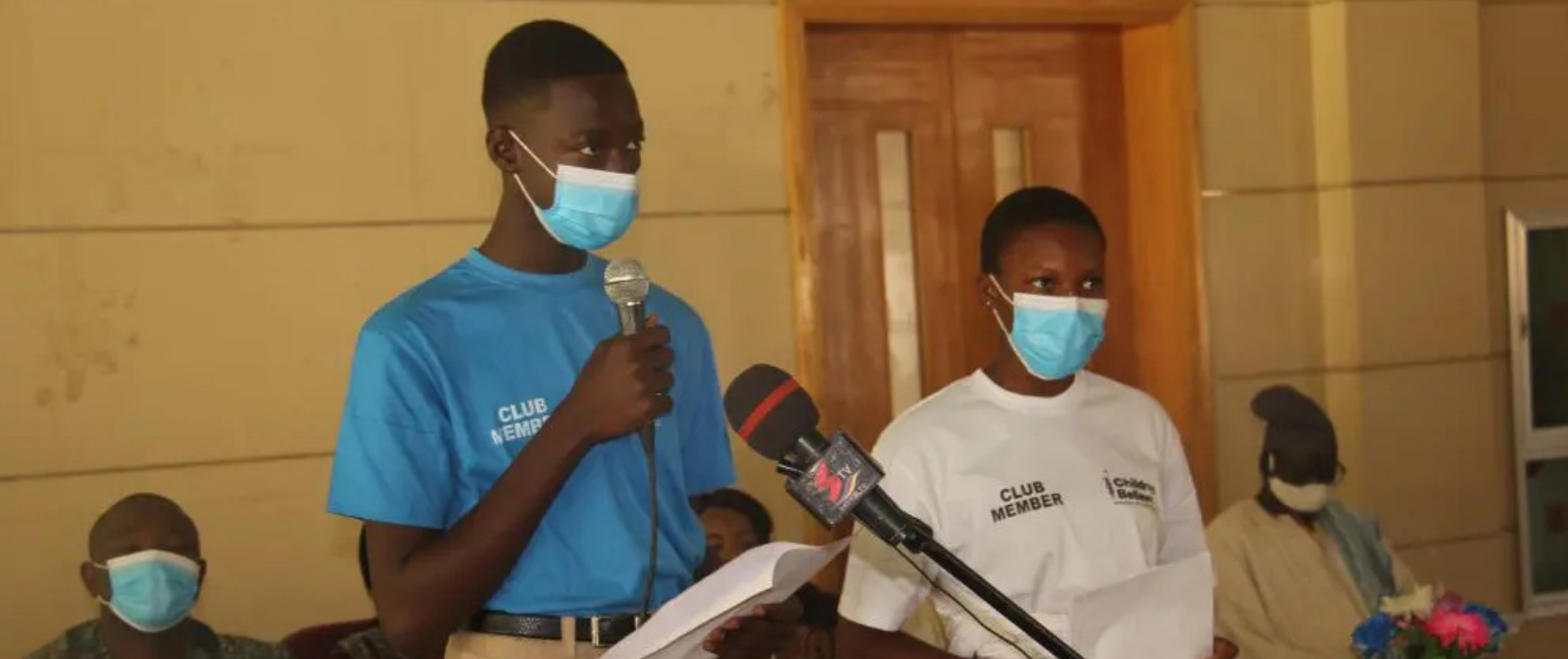
Youth in Ghana work with ChildFund to help kids advocate for their guardians and government to keep them safe during the pandemic

school dropouts. In addition, the pandemic limited opportunities for children to engage in activities and voice their views on matters affecting their lives.