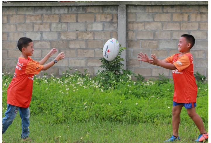
Two young boys enjoy safe playtime during ChildFund’s Sport for Development Reconnect program, hosted in Laos and Vietnam

Key achievements of Reconnect during the nine-month timeline include 80% of participants gaining correct knowledge on handwashing best practices and 64% of players stating they don’t feel helpless when faced with difficulties or challenges in life, compared to 49% at baseline.