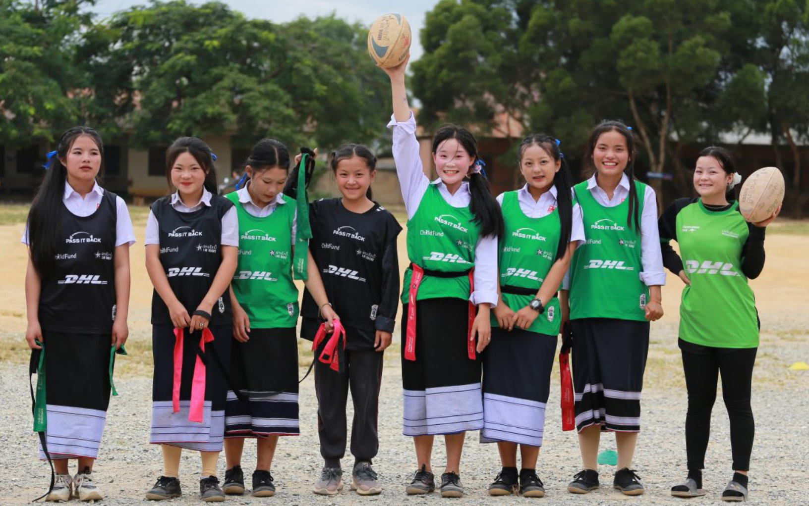
A group of girls engage in ChildFund's Sport for Development Reconnect program