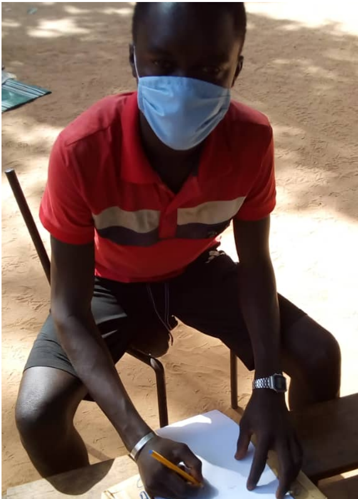
A young boy in Senegal studies remotely during the pandemic

In Cambodia, ChildFund provided Smart TVs to schools, which have enabled teachers to guide children in navigating government education programs on TV as well as through online learning links and applications. ChildFund also lent educational support to adults as well. In Batticaloa in Sri Lanka, ChildFund set up e-platforms so a vital educational program for new mothers could continue to provide them with valuable advice and help. And in Cao Bang in Vietnam, ChildFund delivered events to help educate the community on caring for small children during COVID-19.