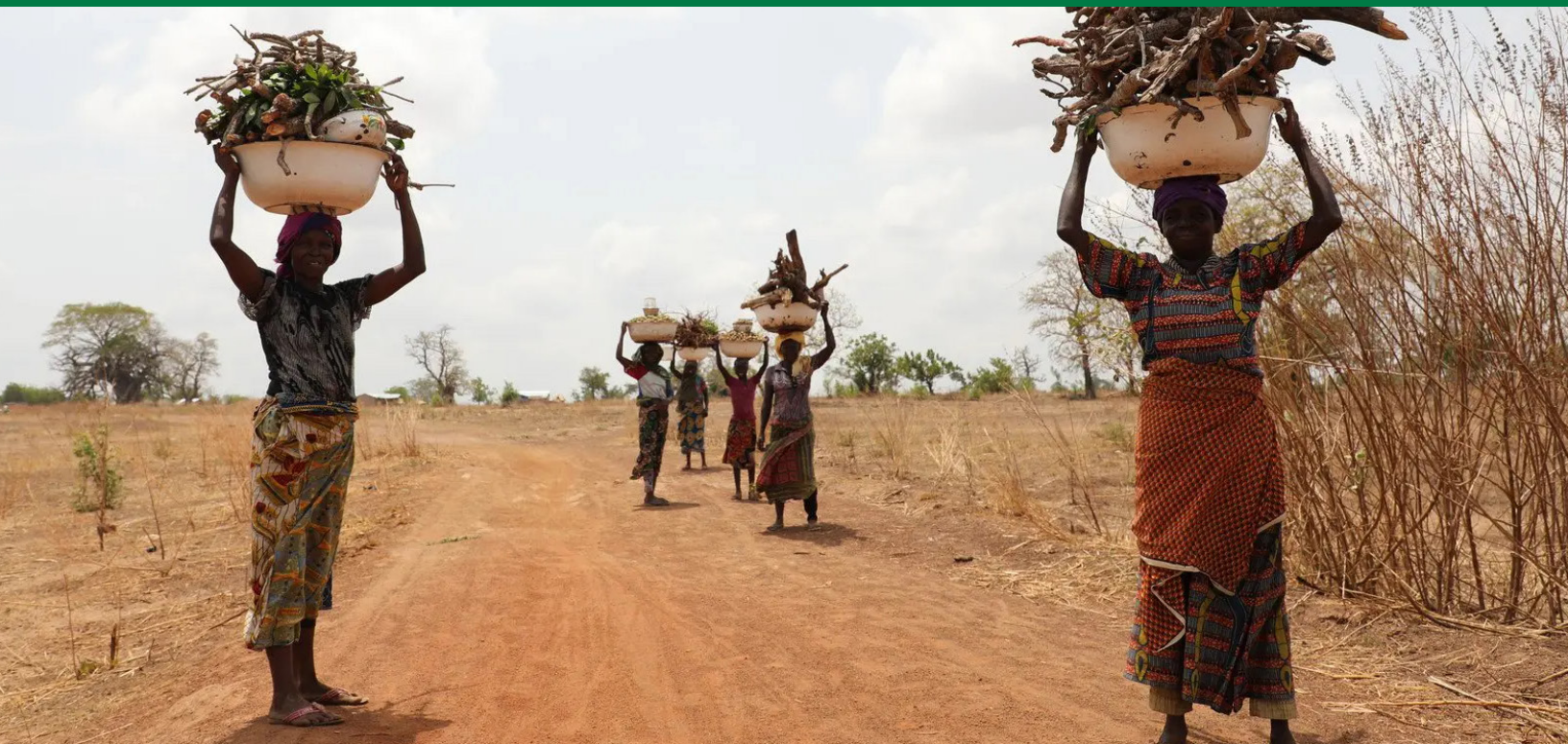
Women carry food baskets in a field in Ghana

ChildFund reached more than 6.8 million children and family members and directed more than $100 million dollars to COVID-19 relief efforts during the first year of the pandemic.