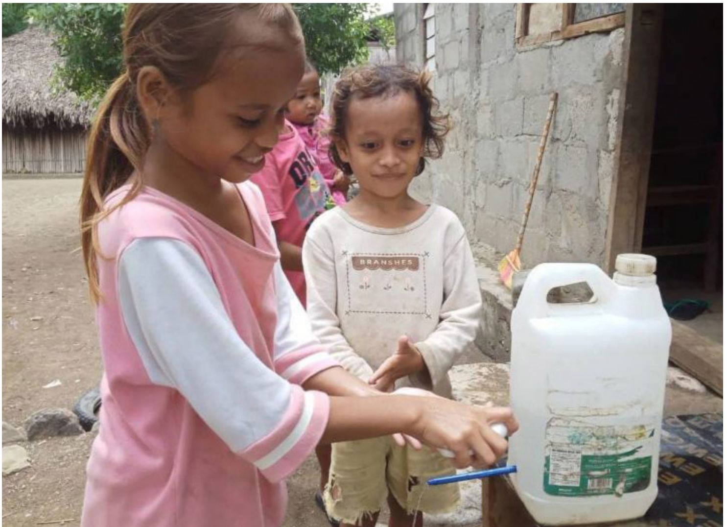
Children in Timor-Leste line up to use soap and water to wash their hands

Indeed, the health crisis, and our response efforts to it, are changing how we provide support and services both now, and, for the long term. Most importantly, we recognize that the ability to adapt and pivot quickly—while always an advantage—is now a prerequisite for all we do moving forward.