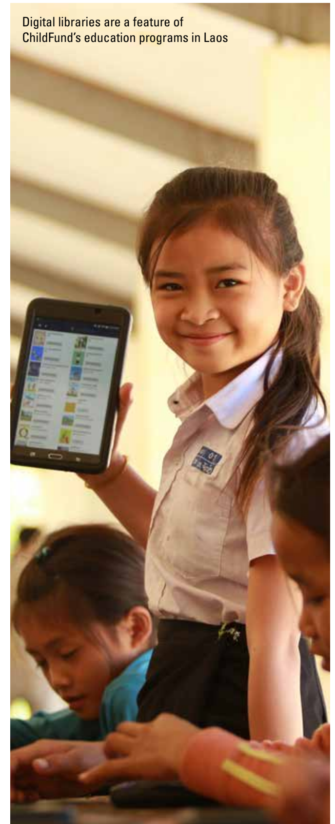
Digital libraries are a feature of ChildFund's education programs in Laos

Understanding how the digital world works, even where a child's ability to access it is limited, is still essential to preventing harmful situations from occurring. It also helps ensure young people are equipped with the necessary tools so they can protect themselves once they do venture into digital environments. 17